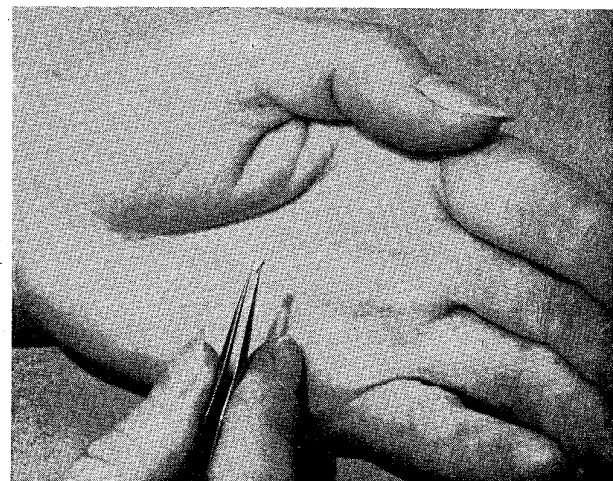
Going down — General Electric's minute new tunnel diode, capable of operating at frequencies above 4 billion cycles, and intended for use in computers, communications equipment, and nuclear controls.

What would our librarian at Caltech say, as she runs all over from one building to another, if I tell